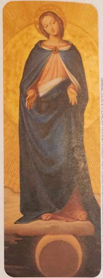
IMMACULATE CONCEPTION BY PHILIPP VEIT (1830)

Mary's Immaculate Conception was celebrated many centuries before Pope Pius IX defined it as dogma on December 8, 1854: "The doctrine that maintains that the Blessed Virgin Mary in the first instant of her conception, by a unique grace and privilege granted to her by Almighty God, in consideration of the merits of Jesus Christ the Savior of mankind, was preserved free from all stain of original sin, is a doctrine revealed by God and therefore must be firmly and constantly believed by all the faithful" ( Ineffabilis Deus ). In fact, eight years before, in 1846, the bishops of the United States had already adopted the Immaculate Conception as the patronal feast for Catholics in this country.