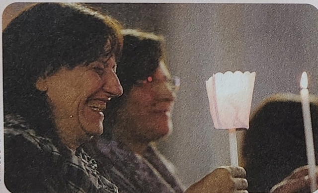
CATHOLIC NEWS AGENCY