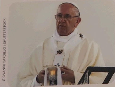
GIOVANNI CARDILLO / SHUTTERSTOCK