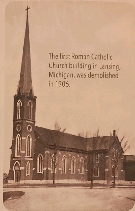
The first Roman Catholic Church building in Lansing, Michigan, was demolished in 1906.