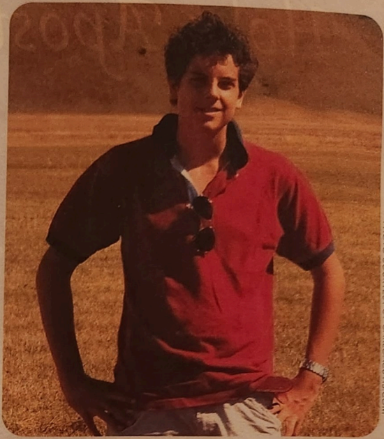
Blessed Carlo Acutis (1991–2006) served the needy and built an internet gateway for exploring eucharistic miracles.

The beatitudes offer us a blueprint for holiness. If we are poor in spirit, mourning, meek, hungry for righteousness, merciful, pure, peacemakers, or persecuted for doing what is right, we are on the road to sainthood. Reflect on one of the beatitudes. It can be one you do well or one that challenges you. Discern how you live it out and how you could live it out better. Slowly you will find yourself growing holier, and one day you will find yourself a saint in heaven. ●