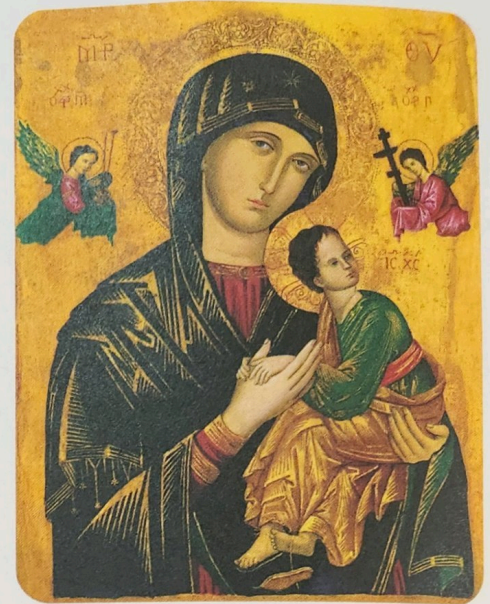
The Redemptorists / DearPadre.org

To see the original icon in real time and learn more about icons, please visit omphicon.org . ●